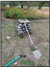
Sundial repair - Resetting and mortaring by volunteer Dick Bingham