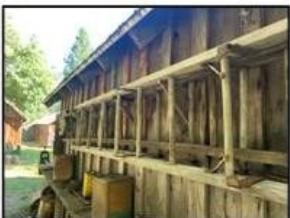
Ladder Hanger rebuild - Foundation volunteer