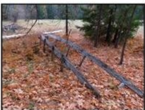
Fuel Platform Rehabilitation - To be completed in 2023. Materials provided by BHHF in 2022 and labor by NPS in 2023