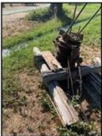
Hercules Stump Puller Base Rebuild - Currently being rebuilt this winter by NPS Stehekin Maintenance , with some materials provided by BHHF