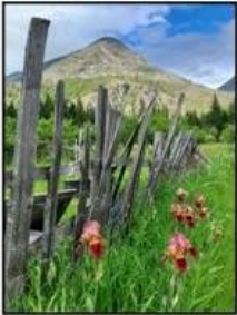
Garden Fence Rehabilitation - Materials collected and fence stabilized in 2022, with rehabilitation to be completed in 2023 by BHHF -funded Washington Conservation Corp crew