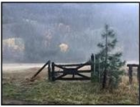
Pasture Gate Rehabilitation - Posts replaced and gate re-hung by NPS

The Little Things - It's all about character. Because of NPS and Foundation collaboration, those small features that provide insight to earlier daily life at the Homestead are being retained. In 2022: